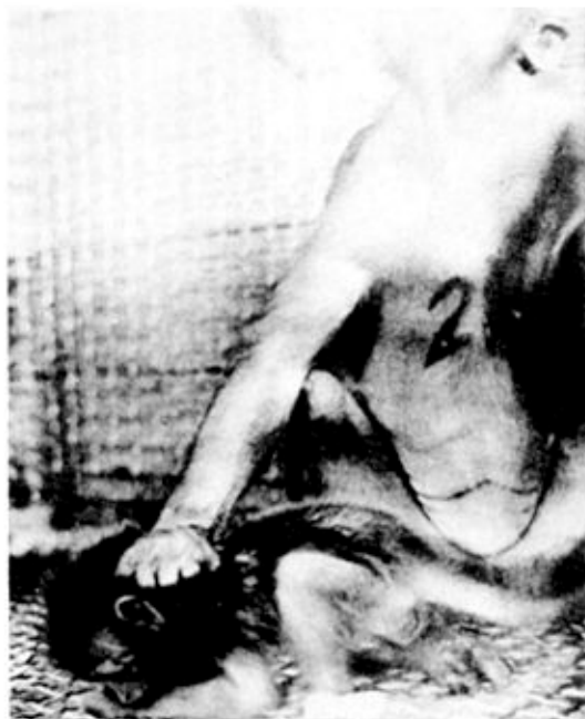
Fig. 6. Motherless mother crushing 20 day old infant to the floor.