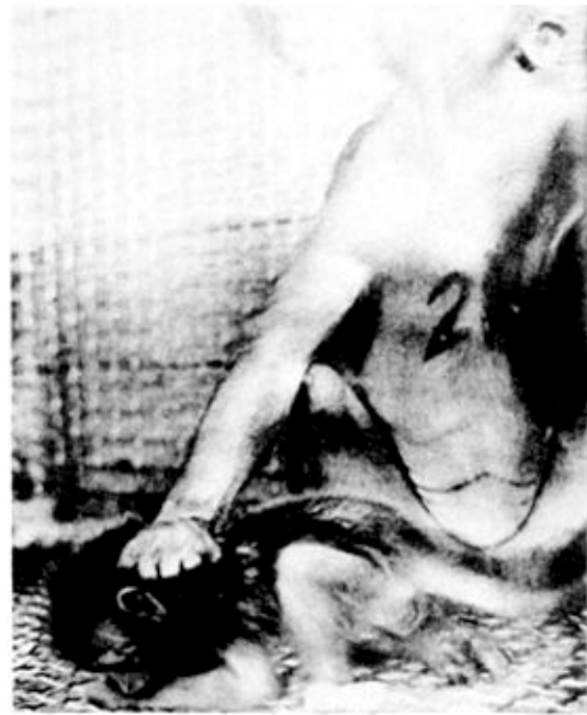
Fig. 6. Motherless mother crushing 20 day old infant to the floor.