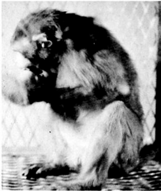
Fig. 5. Self-biting and self-mutilation of an adult isolation reared rhesus.